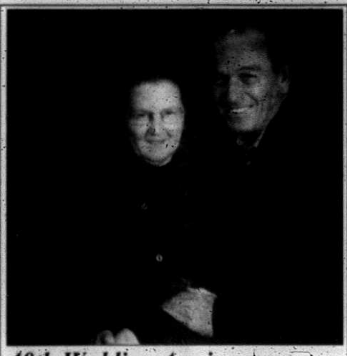
40th Wedding Anniversary