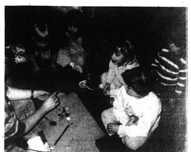
During our study of dinosaurs, the Roundstone preschoolers witness a dinosaur egg hatching out (just pretend, of course!) We also enjoy-earning the big names and which ones ate meat while we made puppel sponge painted and made puffy dinosaurs.

If you have a child who will be entering 6th grade or kindergarten this year, please call 256-2242 now for an appointment as the appointment times are filling fast and there may not be one available if you wait until summer to call.