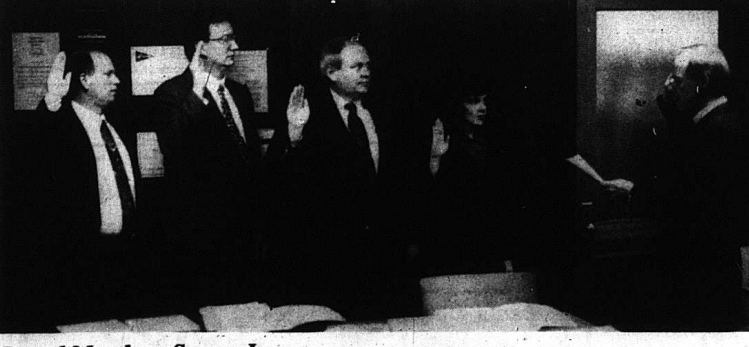
Board Members Sworn-In

wastes. Residents are asked to recycle newspaper, cardboard, aluminum, glass and plastic. If a person is not registered with a hauler for door to-door pick-up of household garbage or if not registered with Bee Garbage Transfer System, Inc. at Burr, they should consider registering. The Universal Colection System is now at 68 percent participation.