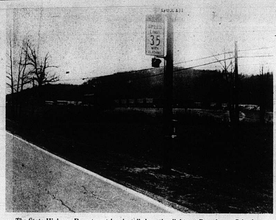
The State Highway Department has installed caution lights at Roundstone School on U.S. 25 north of Mt. Vernon and reduced the speed limit in the area from 55 to 35. The lights will be on each day for approximately 1 hour before and after school. The move was made to enable buses to get in to the school grounds and out onto the highway more safely.