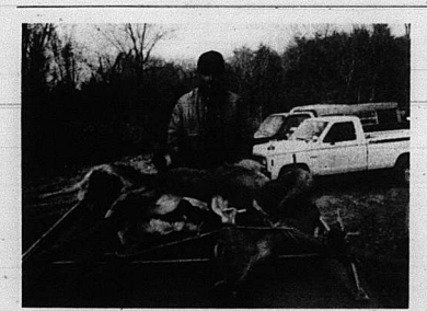
Rodney Alcorn and Freddie Alcorn (not shown) killed these two doe in Christian Co. on Nov. 22.