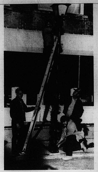
City of Mt. Vernon employees were busy decorating the street lamps on Main Street in preparation for Saturday's parade.