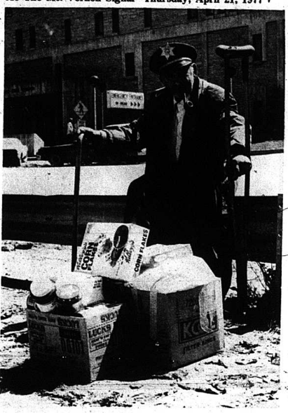
A Bell County man stands watchover emergency food supplies he has just reveived. Distribution of food and olothing to flood victims in Eastern Kentucky is comperation from the comperation of the comperation of the comperation from federal disaster aid offices, and the American Red Cross. Similar aid to disaster victims in available at aid centers in eight locations.

P-At The Mt. Vernon Signal Thursday, April 21, 1977 .