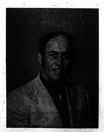
Republican Primary May 24, 1977