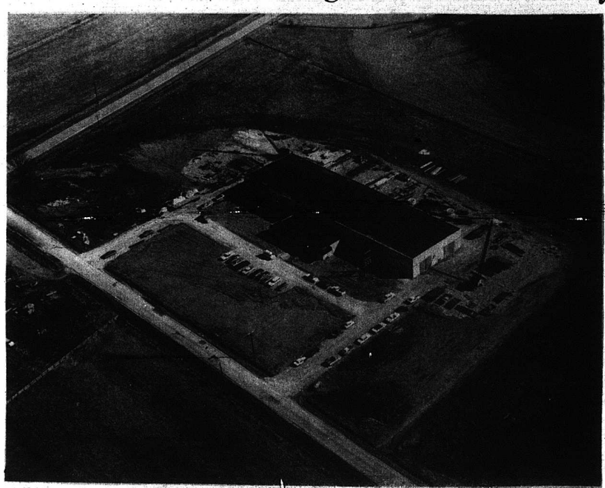
Aerial view of 44,000 square foot steel fabricating facility near Brodhead that has been leased by Braden Steel Corporation for the manufacture of silencing systems for the power generating industry.