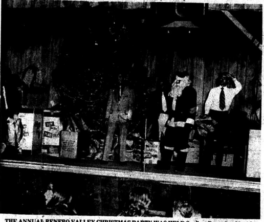
THE ANNUAL RENPRO VALLEY CHRISTMAS PARTY WAS HELD Sunday, December 1200 area children on hand for the toys, fruit and candy. The project is co-sponsored Valley. Inc. and the Bockcastle County Jaycese with donations from Bugle subactions.