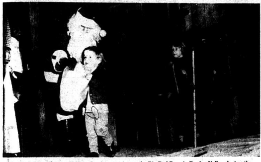
te Christmas Spirit was strong Sunday morning at the Big Red Barn in Rentro Valley during the nual Children's Christmas Party co-sponsored by Rentro Valley, Inc. and the Rockcastle County year. The annual affair, along with others organized by individuals, helped to lessen the ssibility of any child in the county being without a present from "Old Saint Nick."