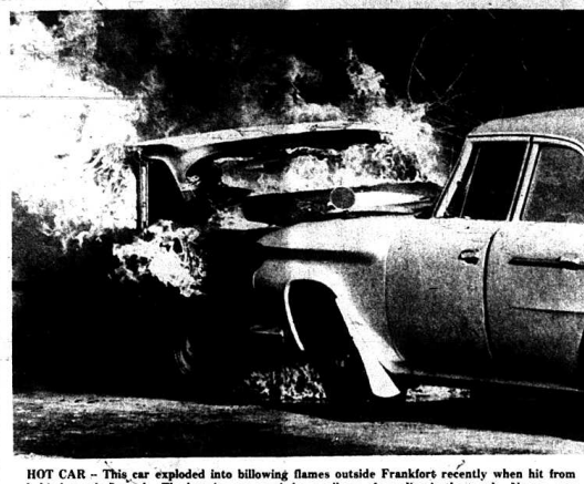
HOT CAR - This car exploded into billowing flames outside Frankfort recently when hit from behind at only 5 m.ph. The burning car carried a small can of gasoline in the trunk. No one was killed because the cars were empty. The explosion was a demonstration set up by state Fire Marshall Warren Southworth to show the dangers of carrying spare gas cans in car trunks. The plastic gas cans many are putting in their trunks, "Southworth said, "are illegal in Kentucky and have been for years. Moreover, it's just very, very dangerous." or partially decayed wood could have very different heating properties.

We are doing our best to stock a complete hardware