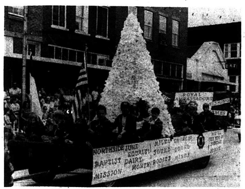
WINNER IN THE FLOAT CONTEST was Northside Baptist Mission whose float was built by their RA organization. The theme of the float was "Milk Equals Sound Body - Church Equals Sound