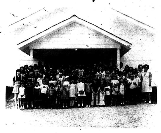
GRADUATION EXERCISES were held Saturday night for students who participated in this year's Vacation Bible School program at Northside Baptist Mission in Mt. Vernon.