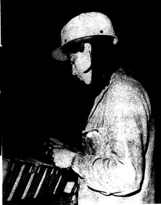
the crop and ship it to market.