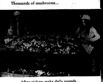
After pickers make daily rounds...