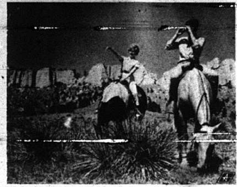
The Seven Sisters Butte in Fort Robin on. Neb., a ne

To be or not to be Europe-bound this year is the question vewine millions of Americans who have travel dollars to spend this year. Chances are, not families will ledect to vacation in the United Chances are, most families will ledect to vacation in the United organization which encourages Americans to count their blessings by traveling their native land. Recaptching the sayings of sages of old, Discover America historiam have segmented permissive reasons for touring America the Beautiful.