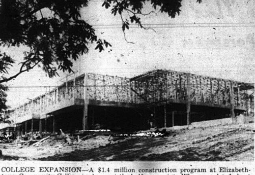
COLLEGE EXPANSION—A $1.4 million construction program at Elizabeth-town Community College is shown at the half-way point. When completed about March 1, 1969, two new additions and instruction and student activities will allow for an enrollment of 1,160 students, compared to a present capacity of 500. The college is one of several in the University of Kentucky system for which construction expansions are being planned.