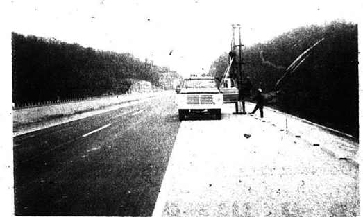
SETTING-POSTS.—Construction-crows drive steel posts, in the ground for the guard rails on Interstate 75 by-poss around Mt. Vernon. A hold-up in receiving guard rails has delayed opening the by-poss.

The next regular meeting of the Mt. Vernon Lion's Club will be held at Belly Acres Restaurant on Thurs-Acres Restaurant on Thursday, December 7 at 6:30 p.m.