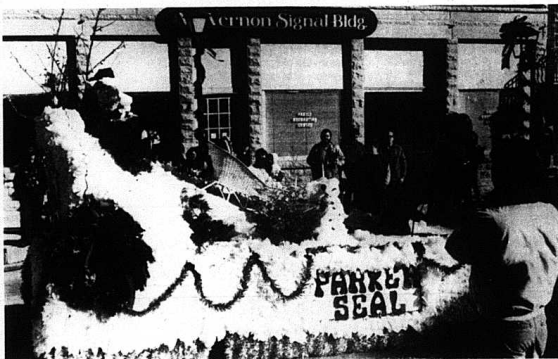
Berea's plant, Parker Seal, also participated in Saturday's parade.