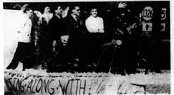
The Rockcastle County High School FFA and FHA clubs also participated.