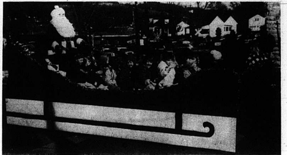
Mt. Vernon Brownie Troop 242 showed off their sleigh and Cub Scout Troop Den number 142 also got into the act.