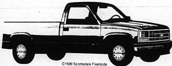
C1500 Scottsdale Fleetside

Free Bed Liner with any new '88 Chevy Pick-Up Truck