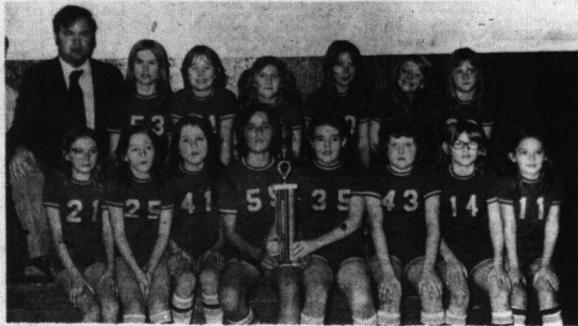
THE LIVINGSTON BLUE DEVILS' Girls' Team won the 5th and 6th Grade Tournament held at Mt. Vernon Elementary last week. They defeated Mt. Vernon in the finals and had

Nicely's Processing Co. Hwy. 150 Mt. Vernon 256-2883 256-2789