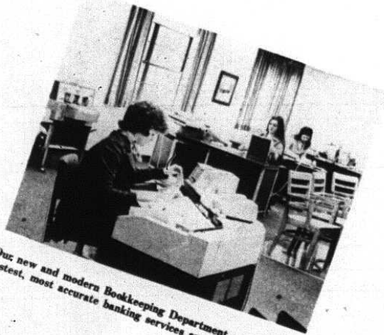
Our new and modern Bookkeeping Department provides the fastest, most accurate banking services available.