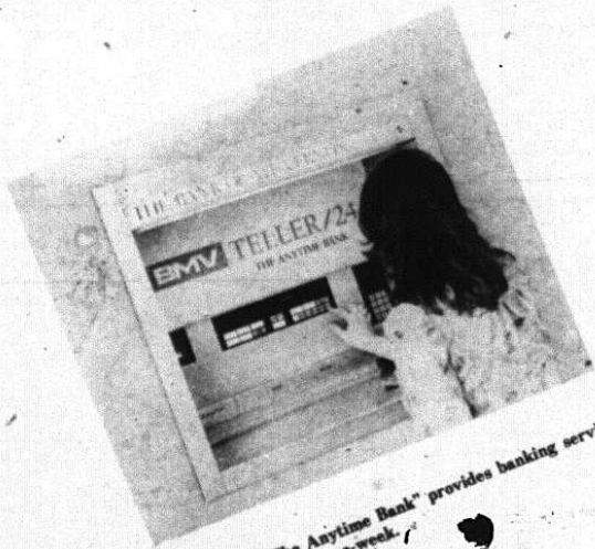
TELLER/24, "The Anytime Bank" provides banking services 24 hours-a-day, 7 days-a-week.