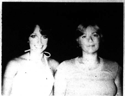
THE MT. VERNON SIGNAL THURSDAY, JULY 14, 1977 P-13

The complete English vocabulary is said to consist of over a million words but it's doubtful whether anyone knows more than one-fifth of these.