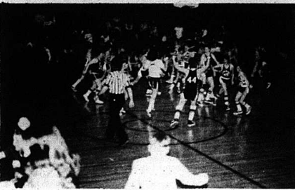
The Mt. Vernon Elementary School 8th Grade Basketball Team snapped a long, dry spell recently by winning the 8th Grade County Basketball Tournament. They defeated Livingston in the finals at Brodhead. The team is shown in the above photo, immediately after the game, celebrating their win.