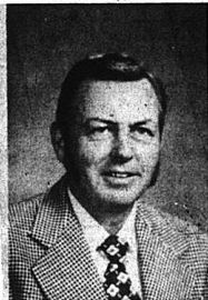
“Your Vote And Support Appreciated” pol. adv. pd. for by candidate Rep. Primary May 24, 1977